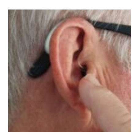
Synapse XT Review - Does It Really Works?