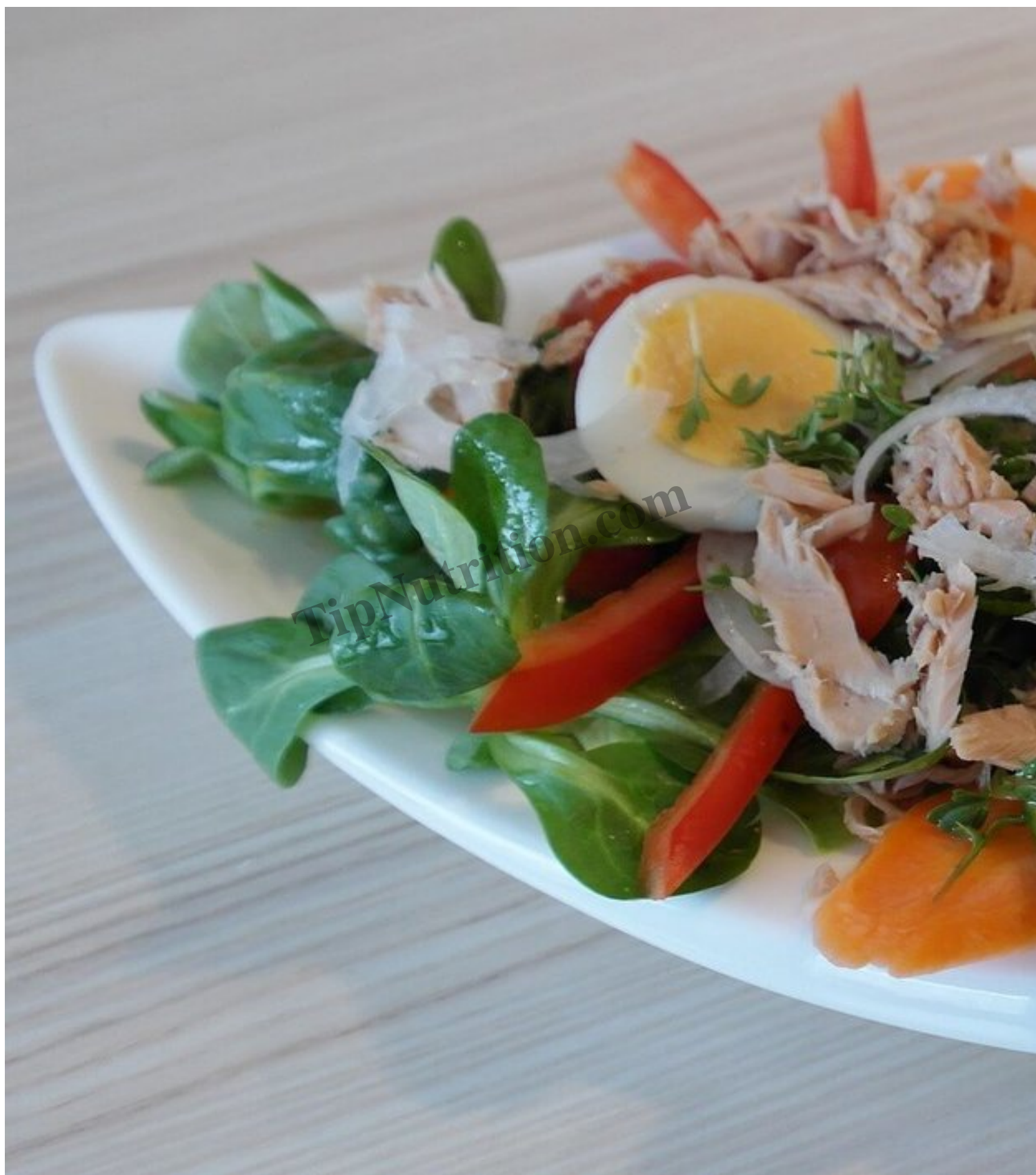
Tuna salad composed with a lemony vinaigrette rather than an old-fashioned mayo-based dressing